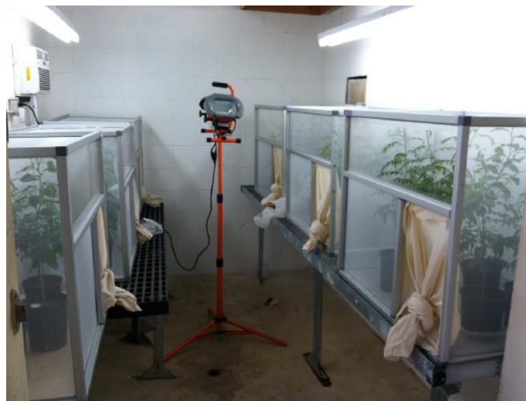
Biocontrol Rearing Process

CITRUS PEST & DISEASE PREVENTION DIVISION CALIFORNIA DEPARTMENT OF FOOD AND AGRICULTURE