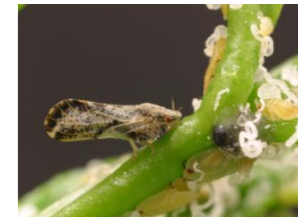
Adult feeding with nymphs

CDFA REPORT A PEST HOTLINE: 1.800.491.1899