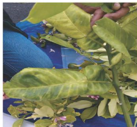
Asymmetric leaf mottling