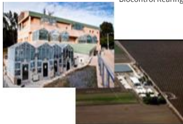
Biocontrol Rearing Facilities