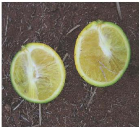
Lopsided fruit with aborted seeds

CITRUS PEST & DISEASE PREVENTION DIVISION CALIFORNIA DEPARTMENT OF FOOD AND AGRICULTURE