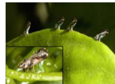
Asian Citrus Psyllid