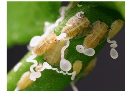
Nymphs with wax exudate